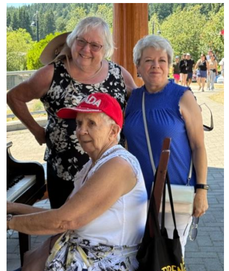
Two past Grand Organists (standing) and our present Grand Organist (sitting)